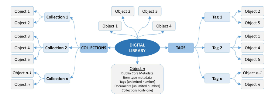
Figure 1. A diagram of the elements of a digital library in Omeka

The user is free to import an unlimited number of items, documents, signs and collections. The only limitation is that one item can be adjoined to one collection only (Figure 1)<sup>14</sup>. Each of the aforementioned elements of the digital library is liable to a complete visibility control on the web. This control encompasses everything from individual metadata to all of the element in the whole.