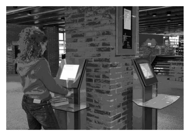
Fig. 5: Self-service unit

to achieve a high percentage of self-service, otherwise the accepted usage is around 25%. In the case of RFID self-issue, faster and easier book checking has resulted in much larger proportions of books being returned without staff intervention, over 40% at Middlesex University.