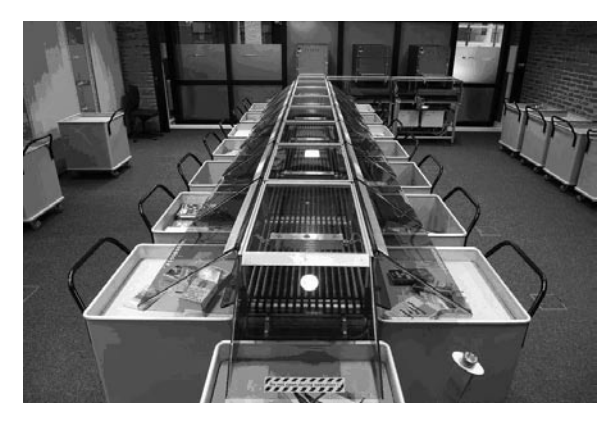
Figure 4: Sorting unit.

Over the last decade, British libraries have introduced self-issue systems and self-return systems. There have been many problems with them particularly as regards the security aspects: most have used electromagnetic security systems. In some universities using electromagnetic systems, they have closed down manual issue desks and forced students to use self-issue systems, in order