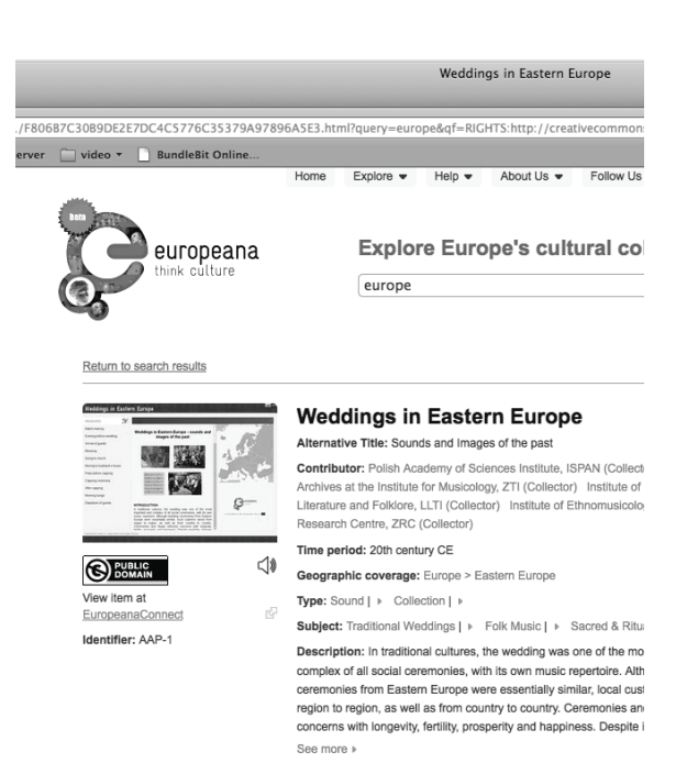
Figure2: Preview with rights badge

As part of Article 4, data providers allow Europeana to store previews on its servers and to publish the stored previews on Europeana. Previews may only be published together with the metadata that they pertain to, which ensures that they will be attributed to the data provider and that the correct rights information will be shown alongside the previews.