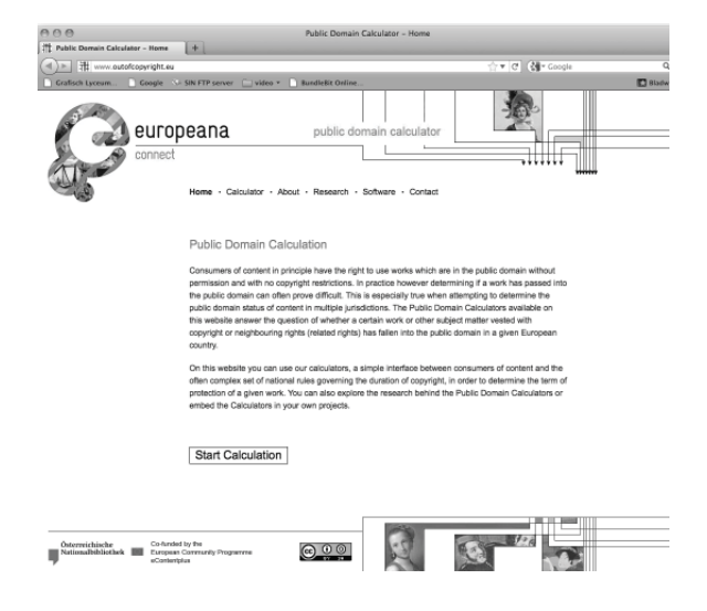
Figure 4: Public Domain calculators at www.outofcopyright.eu

Determining if a work is in the Public Domain or not can be a complicated process. For this purpose Kennisland, the Institute for information law, and the National Library of Luxembourg have developed a set of Public Domain calculators for use in determining if a work is still protected by copyright or if it is in the Public Domain. These calculators can be found at www.outofcopyright.eu.